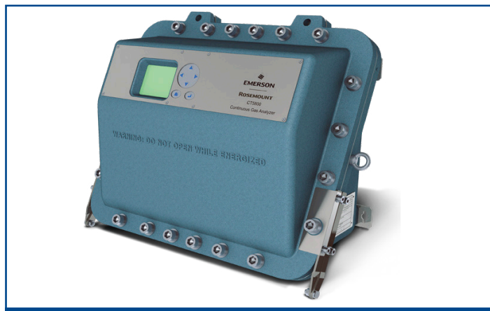
Figure 2 Designed for hazardous areas, the Rosemount CT5800 Continuous Gas Analyzer features an IP66 field flameproof enclosure ATEX II 2G Exd IIB + H2 T4 for ambient temperature from -20 to +55 °C.

Response time is critical in optimizing process of the fractionation tower. Using a Rosemount QCL/TDL gas analyzer allows the sample to flow through a measurement cell where laser beams continuously analyze the gas. The response time is fast and the output is effectively continuous and in real time. This speed of the laser measurement is helpful because it can quickly detect a process upset that might otherwise cost hundreds of thousands of dollars per hour to correct.