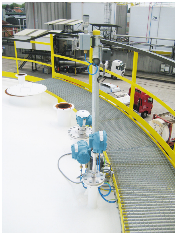
Figure 1. Newer technologies such as radar gauges for level measurement and multi-spot temperature sensors reduce traditional challenges, including maintenance, safety, and inaccuracies in tank inventory measurements.

For tank inventory measurements and transfers, multiple accurate measurements such as level, tank