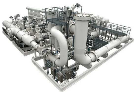
Figure 2. Leveraging technologies such as Coriolis flow meters and ultrasonic flow meters in custody transfer metering systems are best practices for reducing fiscal risk, ensuring regulatory compliance, and sustaining measurement performance.