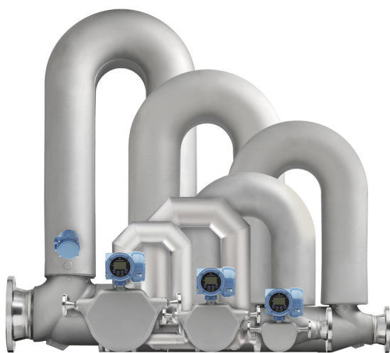
Figure 4. Coriolis meters directly measure mass flow, density, and calculate volume. They do not require compensations due to changes in process conditions or fluids.

Mechanical wear on the meter is not the only factor that impacts accuracy; changes in fluid properties also impact the accuracy of these meters. Today, two highly accurate and repeatable flow measurement technologies, Coriolis flow meters and multiple-path ultrasonic flow meters, offer more sustainable measurement performance with minimal maintenance. Coriolis meters, in particular, directly measure mass flow, density, and calculated volume, making the accuracy of these meters independent of changes in properties.