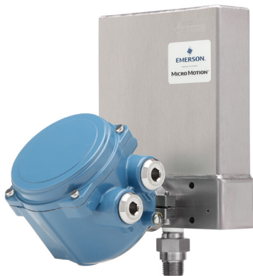
Figure 2. The Emerson Micro Motion HPC015 with rupture disk safety feature.

hydrogen alone will be a complex step, with many elements and industries needing to align.