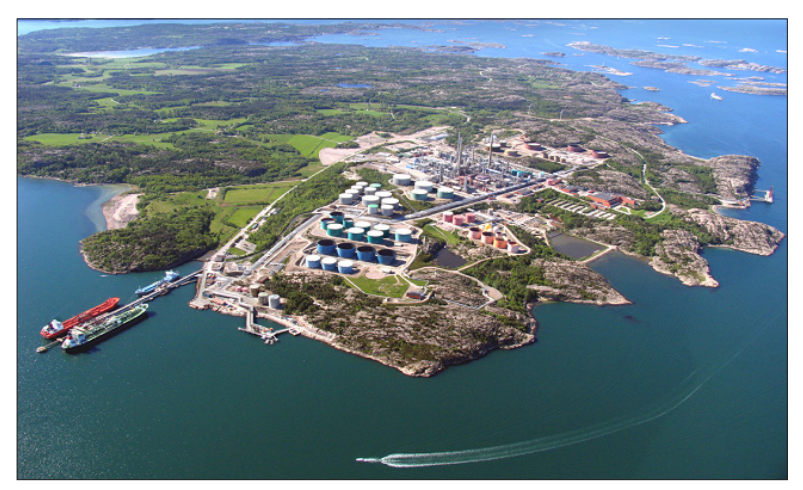
Figure 1 Preem's Lysekil refinery split its single DeltaV control system into two to allow for expansion

In the past, the refinery (see Figure 1) had been controlled by a single DeltaV distributed control system (DCS) with nearly 15 000 device signal tags (DST), 56 redundant controllers, one wireless gateway, 28 operator stations and nine servers. The company has several projects and expansions in mind, yet over time it became apparent that such expansions would be difficult with a single system. The best way forward would be to split the DeltaV system into two. The challenge was to do this without a shutdown and without disrupting production.