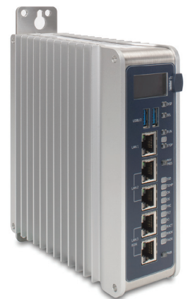
Figure 2: Industrial controllers capable of virtualization, such as Emerson’s Outcome Optimizing Controller (OOC), include multiple processing cores, digital communication ports, and support for parallel operation of a control RTOS and a general-purpose OS.

Today there are hardware advances common to the commercial PC world such as multicore processors and large memory. By using multicore technology and Type 1 virtualization, industrial controller platforms can run multiple OSs on the same proces-