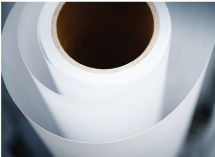
Pulp & Paper