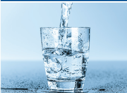
Water & Wastewater

Emerson Impact Partners engineer and deliver solutions across a broad range of industries throughout North America.