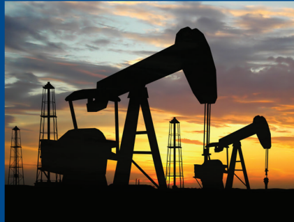
Upstream Oil & Gas