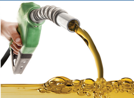
Refining & Petrochemical