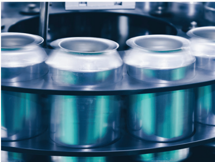
Food & Beverage