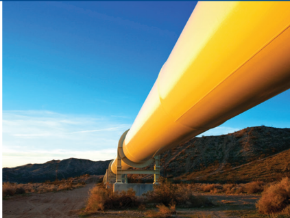
Midstream Oil & Gas