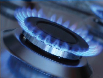
Natural Gas Distribution