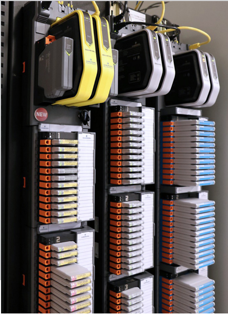
DeltaV™ Electronic Marshalling.