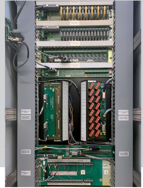
Wiring Solutions for PROVOX™ and RS3™ Systems.