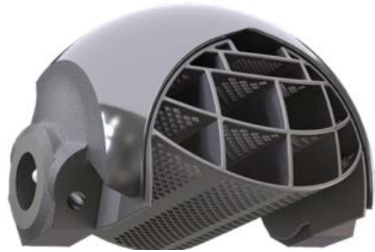
Fisher Whisper NXV Trim