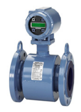
The Rosemount 8732 flow meter

By using meter verification diagnostics, the customer eliminated flow lab costs, maintenance costs, and shipping costs.