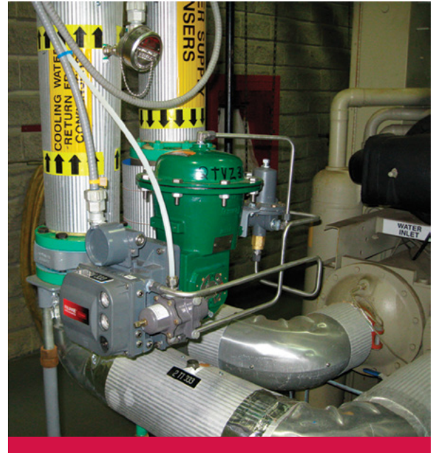
The two new Control-Disk valves installed at CAMECO include Type 2052 actuators and FIELDVUE™ DVC6020 digital valve controllers with Advanced Diagnostics.

“The Control-Disk valves worked well, even before they were fine-tuned,” said Jonathan Smith, a process engineer at the Blind River plant. “We have tried competitors, but we always return to Fisher valves.”