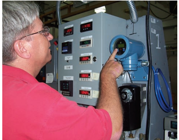
Figure 2 In-situ meter verification both expedites and minimizes maintenance

Overall, staff time spent in both planned and unplanned meter verification has been reduced by 60%. Management estimates that operations and maintenance costs have been reduced by $14,000 per year, while income has increased by more than $124,000 per year due to better availability. The net effect on the bottom line is more than $138,000 in increased profitability.