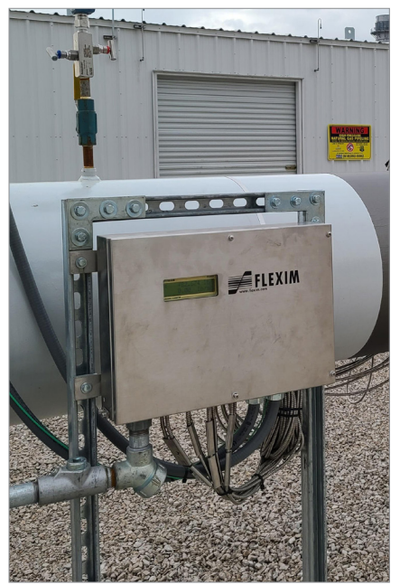
The stationary FLUXUS® G706 is used as a measuring transmitter.