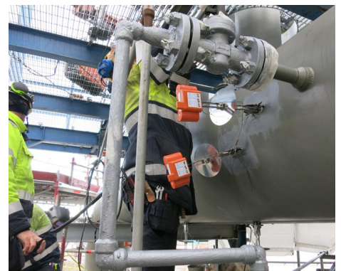
Image 1. Several Rosemount Wireless Permasense sensors were deployed next to the