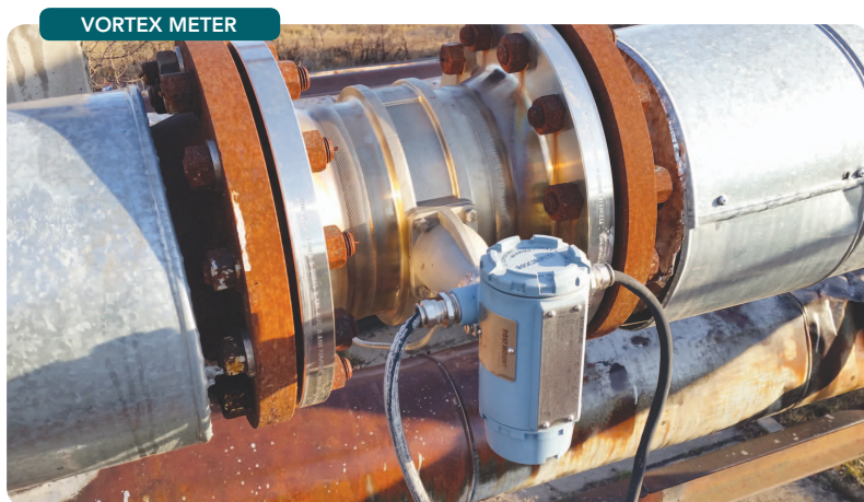
Figure 2. The meter decreased steam leaks dramatically, increasing steam system efficiency and providing very fast payback.

clogging impulse lines, which led to bad measurements.