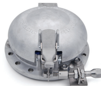
Thief Hatch Monitoring System with GO™ Switch

The GO Switch Thief Hatch Monitoring Kit is designed to fit any thief hatch model. This kit features GO Switch Model 73 which precisely monitors the hatch positioning, ensuring emissions are under control and hatches are fully sealed at all times. Its unique, robust bracket design guarantees no false signaling will occur. Model 73 also does not draw power so the battery life on wireless transmitters is greatly improved.