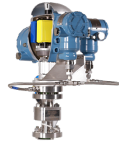
5900S 2-in-1 with dual pressure transmitters

Dual independent level and pressure transmitters ensure ultimate reliability and provide built-in redundancy. All in just one device and using only one tank opening with the Rosemount 5900S 2-in-1 Radar Level Gauge.