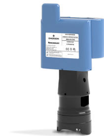
Rosemount Wireless Permasense ET210

The Rosemount™ Wireless Permasense ET210 Corrosion and Erosion Monitoring System is a non-intrusive device designed to continuously measure wall thickness in pipes and vessels using ultrasonic technology (UT). The Rosemount Wireless Permasense ET210 is non-intrusive and battery-powered, allowing for quick and straightforward magnetic installation over erosion hotspots in both single or multiple unit arrangements. The Rosemount Wireless Permasense ET210 delivers data via WirelessHART ®, enabling secure and cost-effective data retrieval to desk.