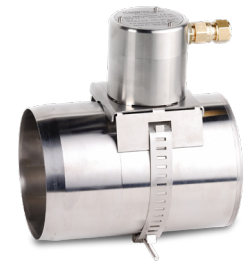
Roxar PIG Detection System

The Roxar™ PDS PIG Detection System is a non-intrusive device designed to detect the passage of pipeline inspection gauges in flow, gathering, and transportation lines. The Roxar PDS is installed over a straight pipe section and data is retrieved via a Modbus® Remote Terminal Unit (RTU), providing actionable information directly to your Distributed Control System (DCS) or Supervisory Control and Data Acquisition (SCADA).