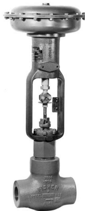
Figure 1. Fisher D Valve with 657 Actuator