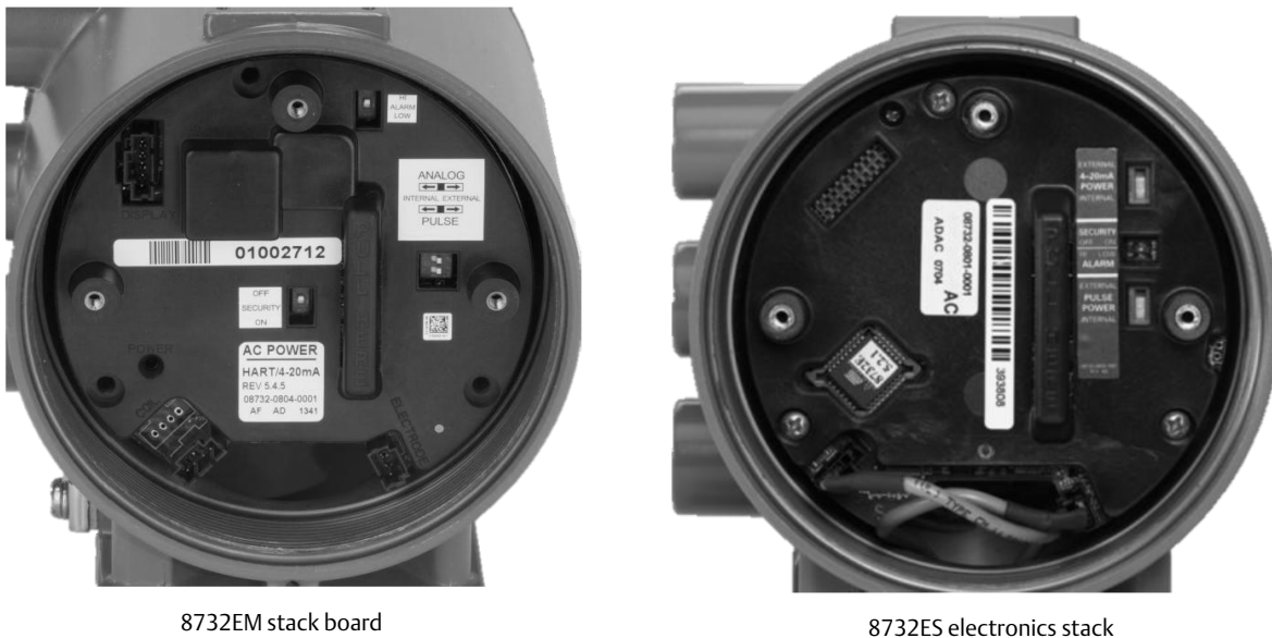
Figure 3. Electronics Stack Identification