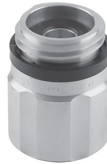
Figure 1. Type M570 Hose Adaptor

Only personnel trained in the proper procedures, codes, standards, and regulations of the LP-Gas industry should install and service this equipment.