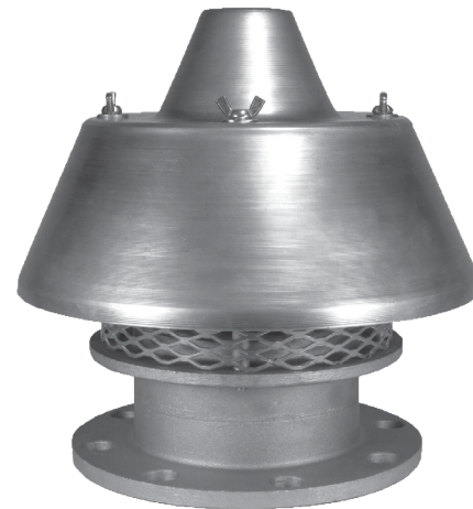
Figure 1. Rim Vent Pressure Relief Valve

This Instruction Manual provides instructions for installation and maintenance for the rim vent pressure relief valve.