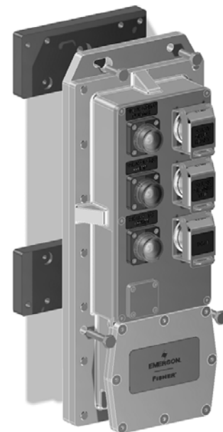
Figure 1. LCP200 with Mounting Bracket

Refer to figure 2 for dimensional information. The LCP200 local control panel has four mounting holes for on-site mounting of the device. The LCP200 must be installed so that the wiring connections are on the bottom to prevent accumulation of moisture inside the box.