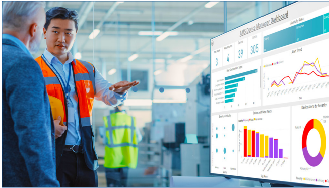
Microsoft PowerBI KPI and Analytics dashboard displaying smart device data via AMS Device Manager Data Server capability.