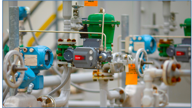
AMS Device Manager Data Server offers a solution to aggregate disparate and underutilized data from smart devices like control valves and measurement instrumentation, and further exploit it for positive impact elsewhere in the organization or technology stack.