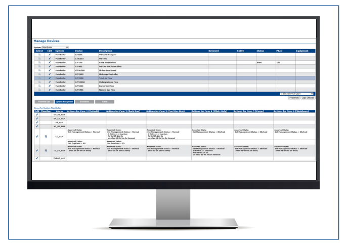
Dynamic Rationalization Configuration of Dynamics in the AgileOps Database.

Dynamic alarm rationalization can be completed simultaneously in the AgileOps Database when static rationalization is done, minimizing rework. Any configuration in the master database is automatically brought into AgileOps Dynamics with no end-user input required. Updates in the AgileOps Database are also automatically updated to AgileOps Dynamics in real-time. URL links between AgileOps Dynamics and Database allow for easy navigation between the features in the web environment.