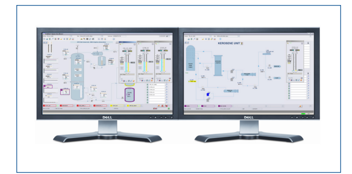
Dual screens provide more screen area for viewing multiple faceplates.

The two monitors act as one large monitor, providing a larger contiguous screen area for the operator. They can be positioned either horizontally or vertically as shown below. No matter which monitor arrangement selected, the user can move the cursor across the monitors as if they were a single monitor. Windows can be easily positioned across the monitors, just as they are moved on a single monitor.