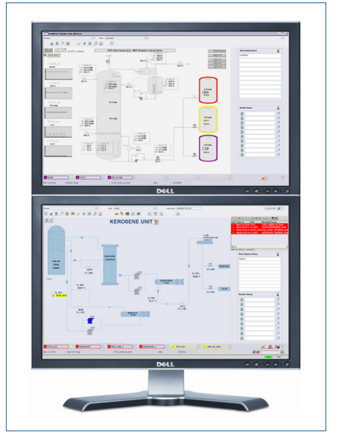
Monitors can also be mounted vertically with the cursor movement set to allow the mouse to move the pointer vertically to access the upper screen.

When a single monitor is dedicated to DeltaV Operate, DeltaV Operate behaves the same as a DeltaV Operate screen on a single monitor workstation. Faceplates and other popup displays may be defined to launch on the second monitor. Additionally, the second monitor can be used to view other applications without obscuring the operator process graphics.