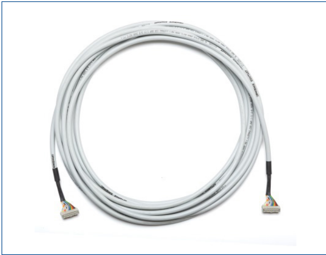
The 6m long Standard Round Ribbon Cable is recommended for distances longer than 3m. (20-pin DI/DO shown above)