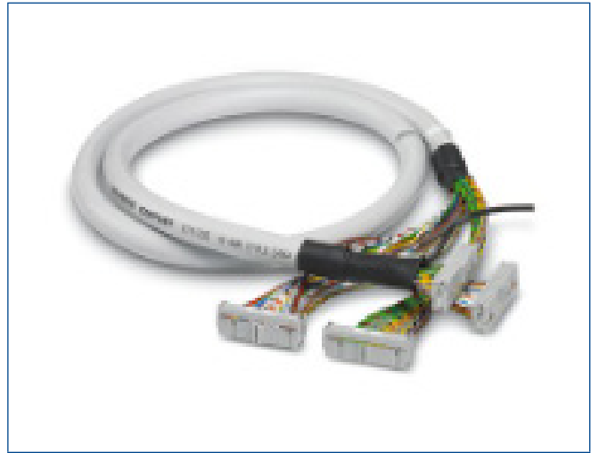
The 6m long 48-pin – Special Round Ribbon Cable is recommended to be used with analog signals for distances longer than 3m.