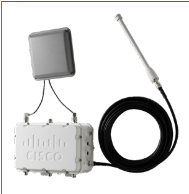
1552WU with 5 GHz Wi-Fi patch antenna and remote mounted WirelessHART omni antenna