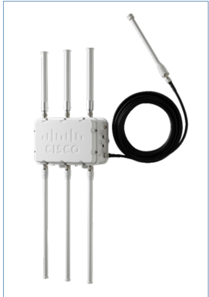
1552WU with Wi-Fi omni antennas and remote mounted WirelessHART omni antenna

EMC Performance: Complies with EN61326-2-3:2013