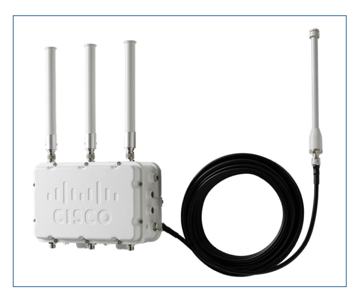
1552WU with 5GHz Wi-Fi omni antennas and remote mounted WirelessHART omni antenna.

Emerson North America, Latin America: $\infty$ +1 800 833 8314 or