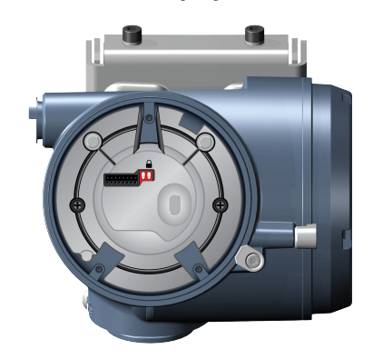
Figure 2-3: Write protect (dip) switch behind the display module

Write protection is enabled by toggling the physical write protect (dip) switch (identified by a lock icon) located behind the display module.