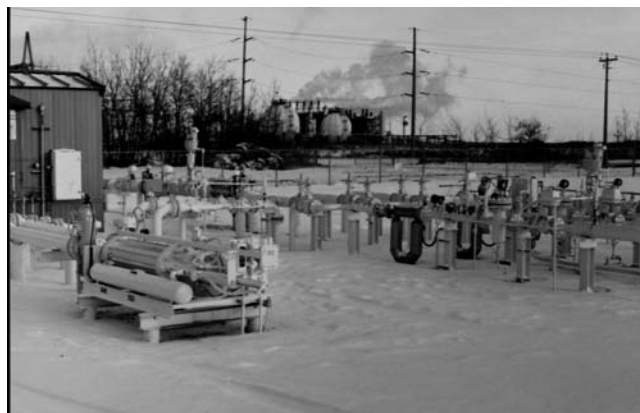
In the background are three Coriolis meters at the end of one of Pembina's pipeline at Fort Saskatchewan, Alberta, just prior to the pipeline entering a customer's facility.

In addition to simplifying the instrumentation system, Pembina management chose three meters in parallel to