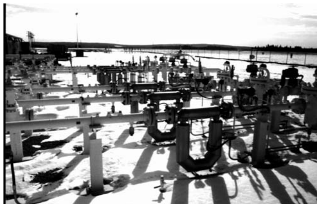
Micro Motion Coriolis meters simplified multi-product pipeline instrumentation. The three meters in the foreground measure product from Taylor, British Columbia and the three in the background measure product from Dunvegan, Alberta.

The light hydrocarbons were measured by a turbine meter, which used an impeller or multi-bladed fan to measure volume, and a densitometer to measure density. To measure crude and condensate, a valving system switched to a positive displacement (PD) meter and densitometer. A PD meter has one or more rotating gears or impellers that fit snugly in the meter body to minimize slippage. Multiplying the measured volume by the density determines the mass. Although product mass is not required, the density measurement is used for batch tracking, or to keep the batches segregated.