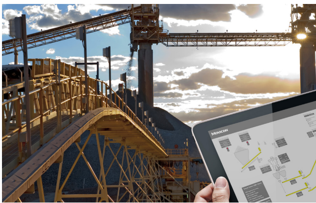
Figure 1. OEMs harness the power of IIoT and edge solutions to help mining operators unlock more productivity from their assets. Using proven hardware/software platforms instead of custom developed projects minimises risk and project costs.

By nature, many goals of an OEM equipment supplier and a mining end user are in alignment. They both want the equipment to perform reliably and be cost-effective,