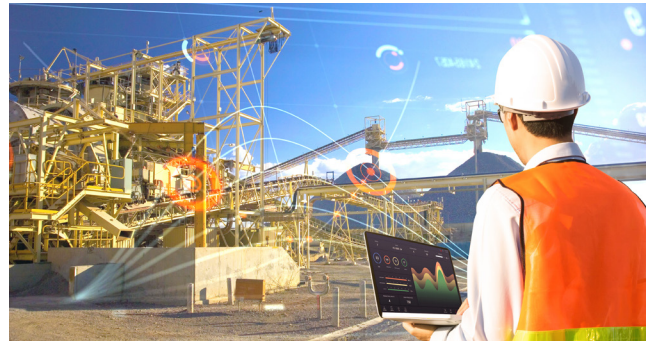
Figure 3. Clear OEE and energy visualisation, supplied using Emerson Movicon with Pro.Lean and Pro.Energy modules, helps users develop improved operating strategies and more sophisticated analytics.

One initial consideration for industrial use is to choose products with a proven reliability record when installed in the most challenging locations. Evaluating the hardiness and suitability of hardware can be straightforward, but the path is less clear for software. Consumer or